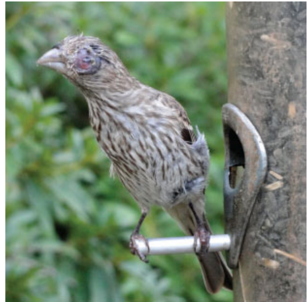
A house finch ( Haemorrhous mexicanus) infected with the bacterium Mycoplasma gallisepticum.

pathogen and its host animal. Australian microbiologist Frank Fenner took advantage, setting up just the right experiments at just the right time—and he and colleagues kept them going for more than 35 years. 4 The body of work he produced and inspired in others has generated a detailed view of the evolution that ensues when a virus emerges in a new host population. 2 In the process, it also offers important insights into how pathogens might react when interventions such as vaccination and genetic engineering make hosts more resistant to their infections—an important ambition in agricultural and human medicine.