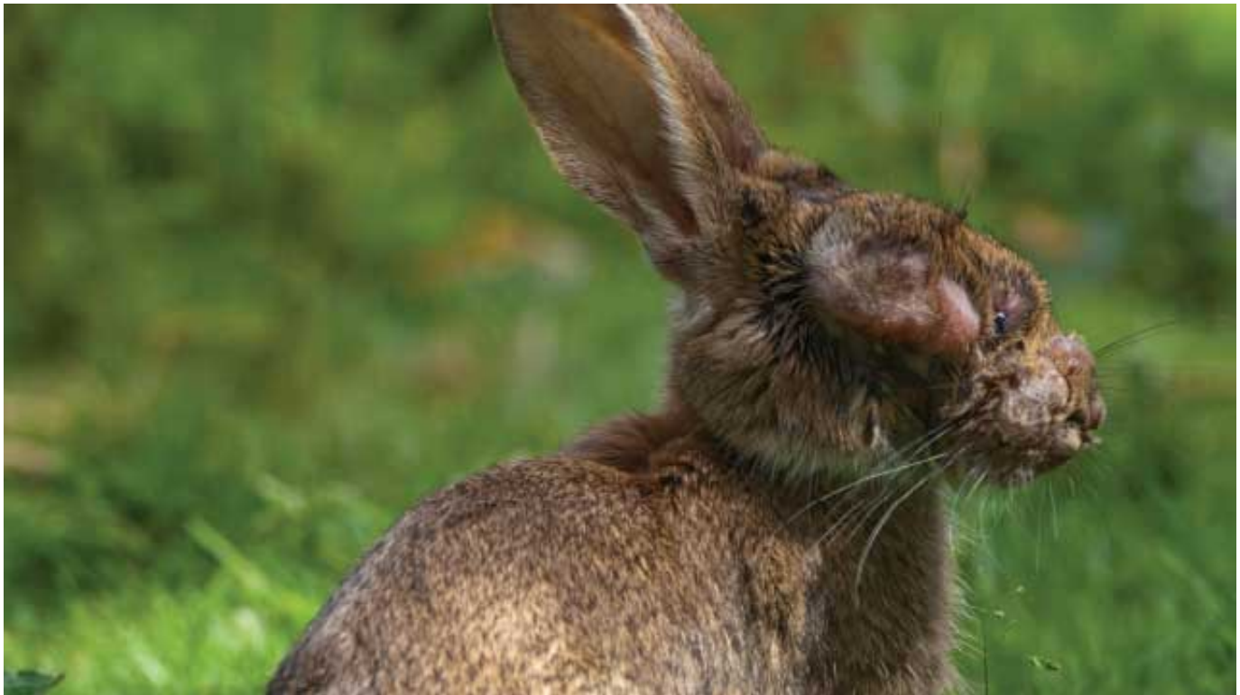
WILDLIFE DISEASE: A European rabbit ( Oryctolagus cuniculus ) suffering from myxomatosis.